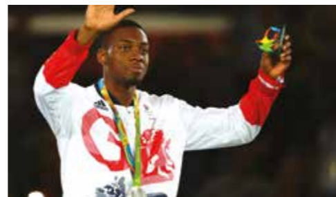
Lutalo Muhammad, Rio silver Taekwondo

The total number of athletes supported by the GSF that competed at the Games totalled forty five; the 20 medal successes further eclipsed the London 2012 and Olympic Games where fifty nine supported athletes won thirteen medals.