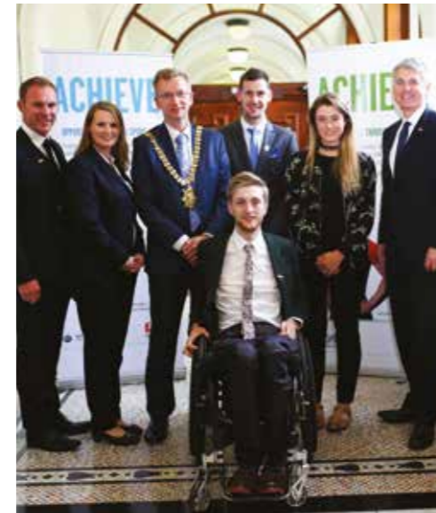
Belfast GLL Sport Foundation Awards Event