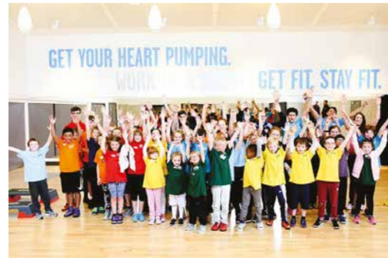
Belfast supported athletes attended the Summer Sport Festival.

GLL is a national partner of 'This Girl Can', and supported athletes attended events both at GLL centres and within communities, with the aim to inspire women and girls to be more active.