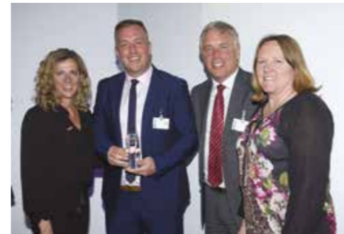
National GLL Sport Foundation Award Event