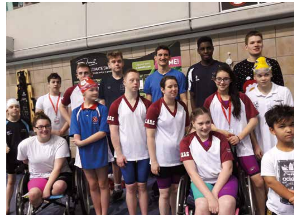
London Disability Swimming Club, supported by the GLL Sport Foundation

With projections of over 2,500 athletes being supported the programme looks forward to supporting athletes across the UK and celebrating their successes in 2017.