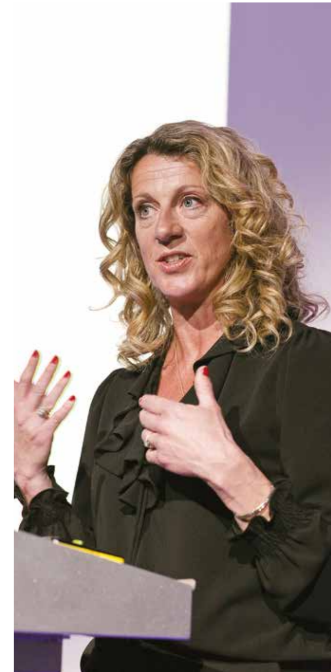
Sally Gunnell, Patron of the GLL Sport Foundation at the 2016 National Event at the BT Tower, London.

Sally Gunnell OBE Patron, GLL Sport Foundation