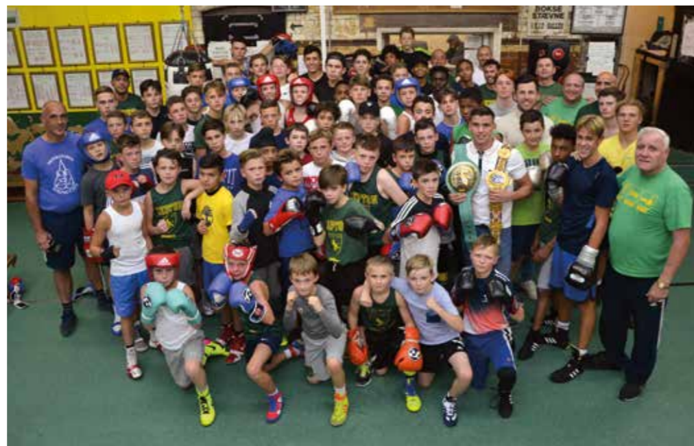
Repton Boxing Club - London: junior programme supported by the GLL Sport Foundation