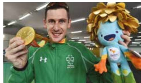
Michael McKillop, Rio gold Para Athletics